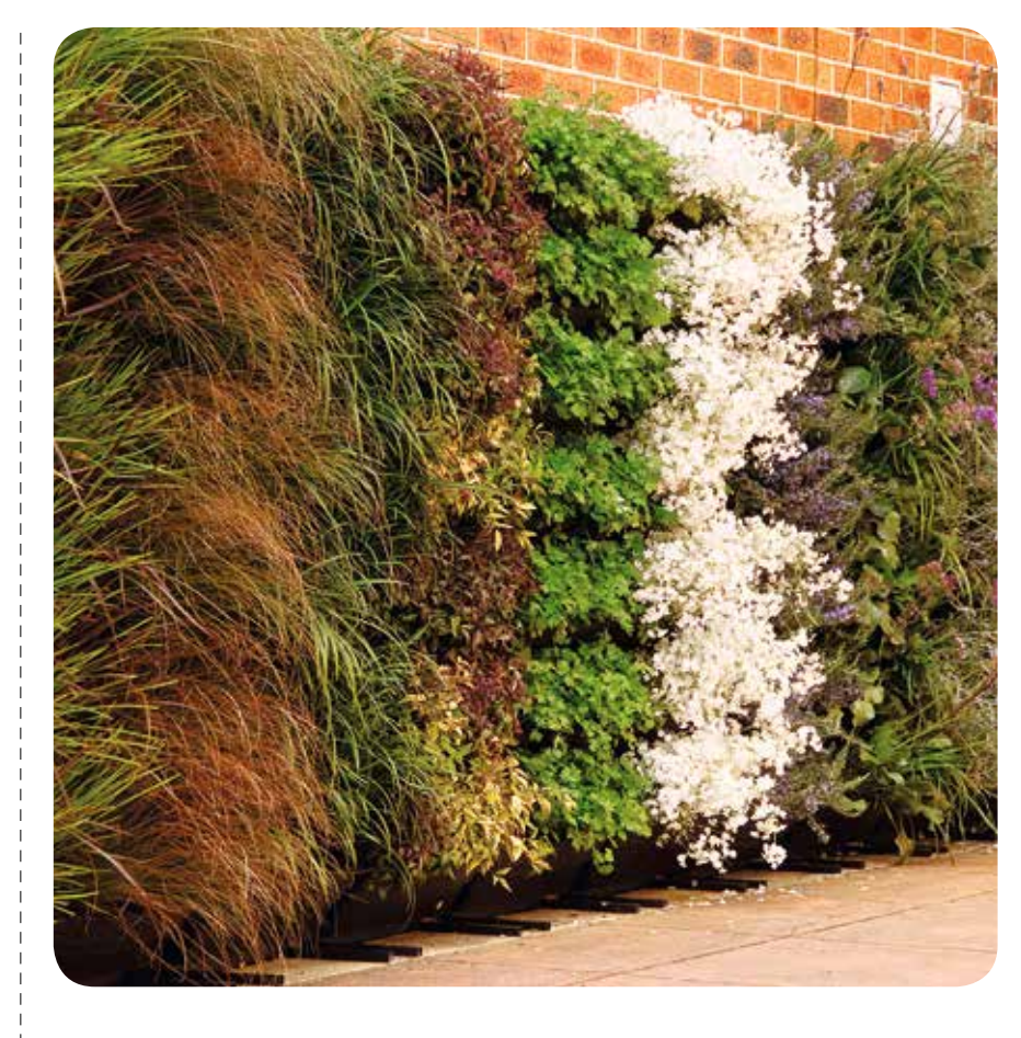
"Run a line of them up the fence, densely plant them with the right plants and suddenly your wall is overflowing with foliage or flower."

Maintenance is the biggest unspoken factor when growing a wall garden. Just as is done with a normal